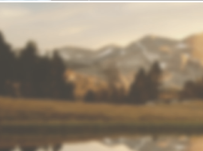
Simulated vision with cataracts