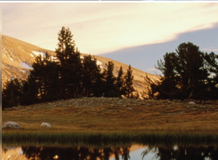
Vision without cataracts